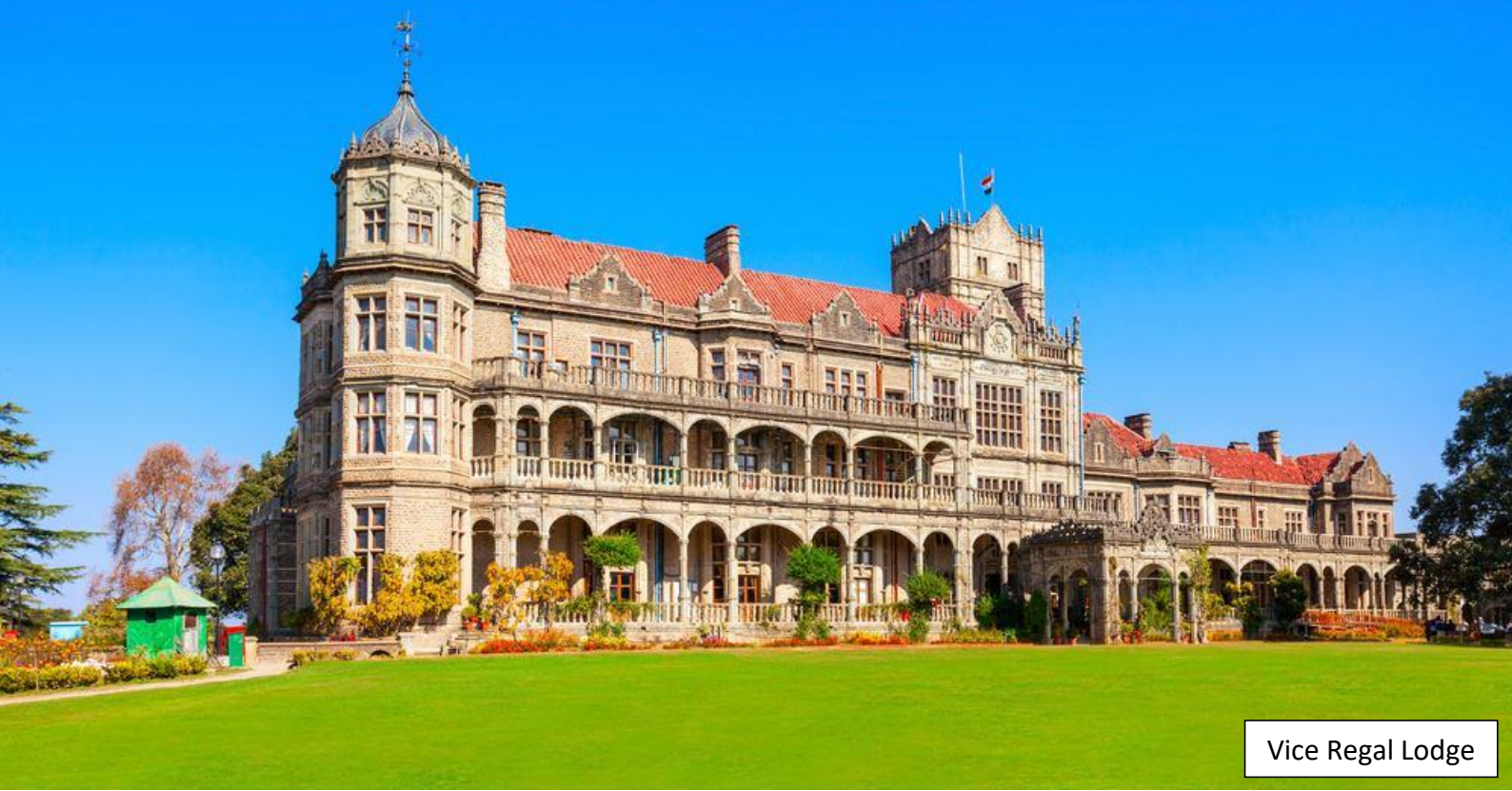
Vice Regal Lodge