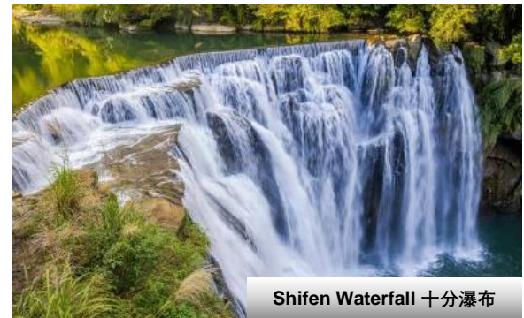
Shifen Waterfall 十分瀑布