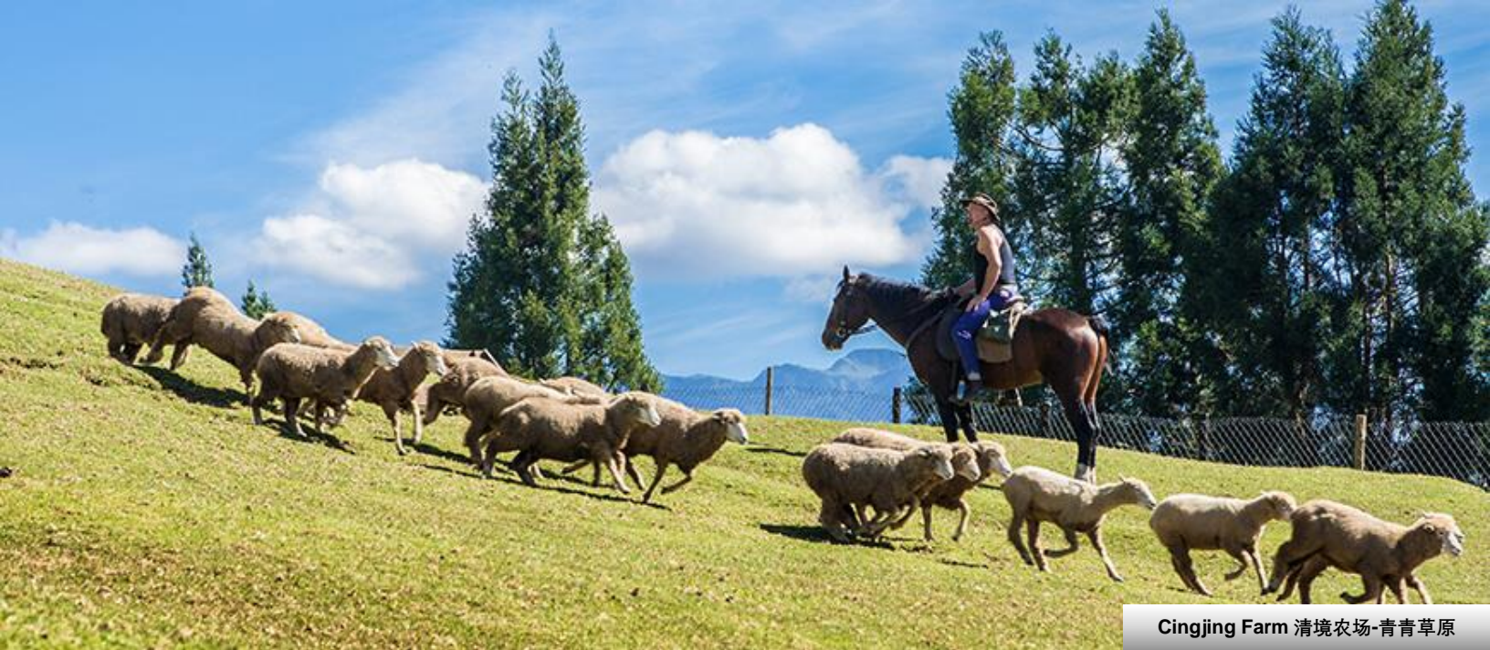
Cingjing Farm 清境农场-青青草原