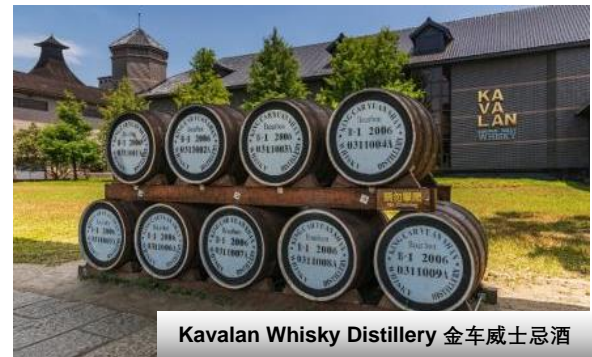
Kavalan Whisky Distillery 金车威士忌酒