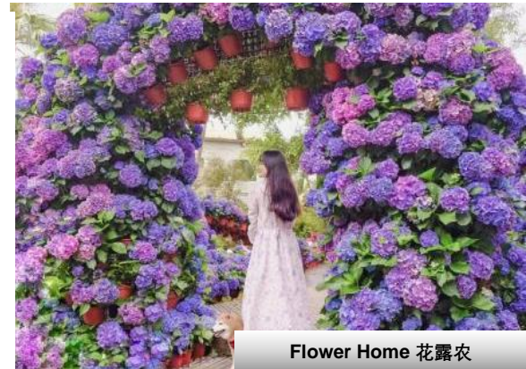
Flower Home 花露农