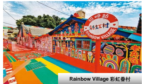
Rainbow Village 彩虹眷村