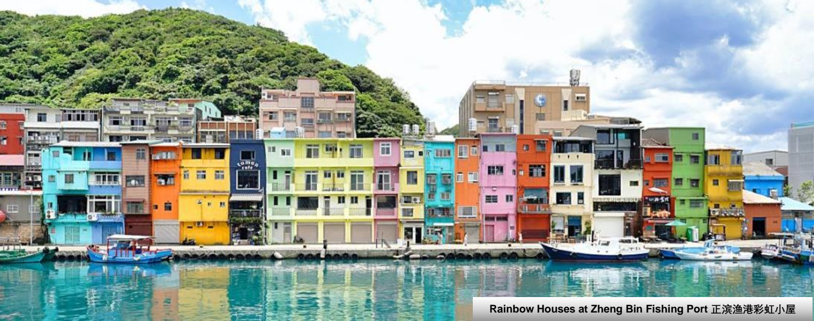
Rainbow Houses at Zheng Bin Fishing Port 正滨渔港彩虹小屋