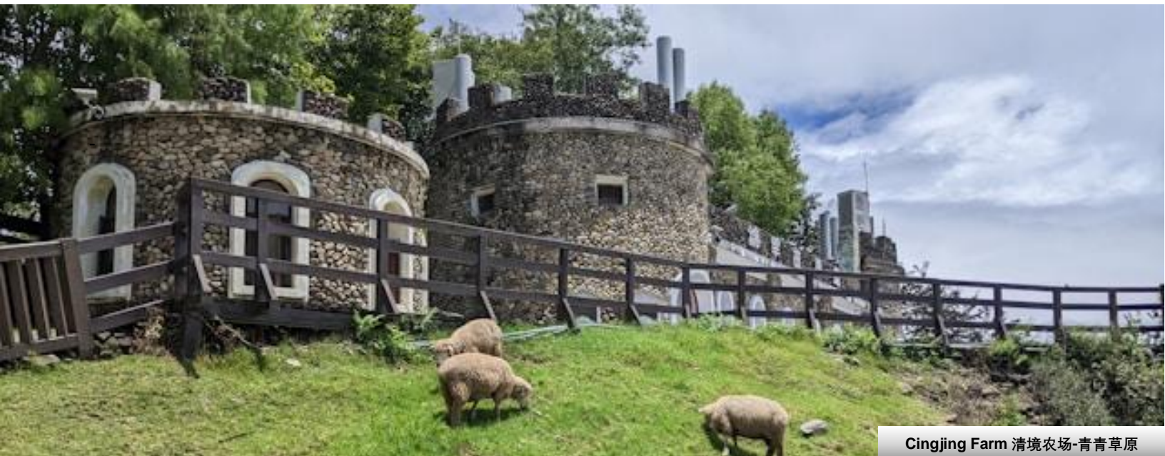
Cingjing Farm 清境农场-青青草原