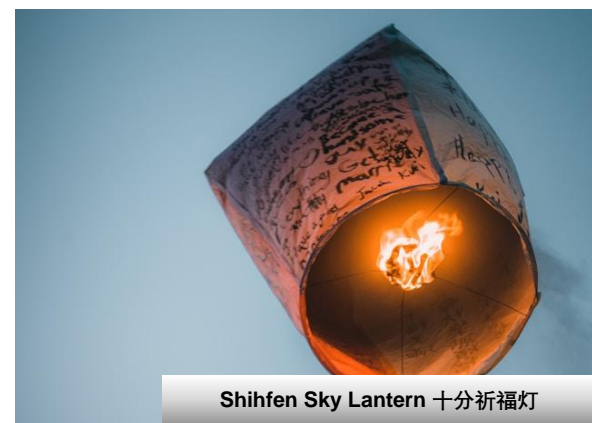
Shifen Sky Lantern 十分祈福灯