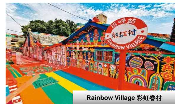
Rainbow Village 彩虹眷村