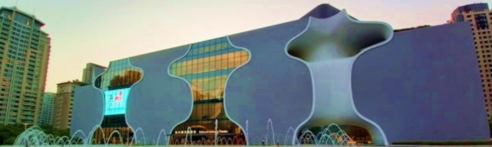
National Taichung Theater 国家歌剧院