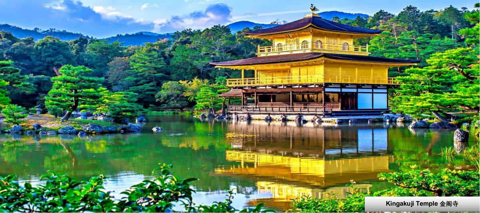
Kingakuji Temple 金阁寺