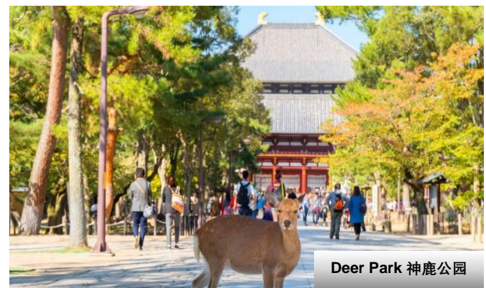
Deer Park 神鹿公园

*Sequence of itinerary subject to arrangement*