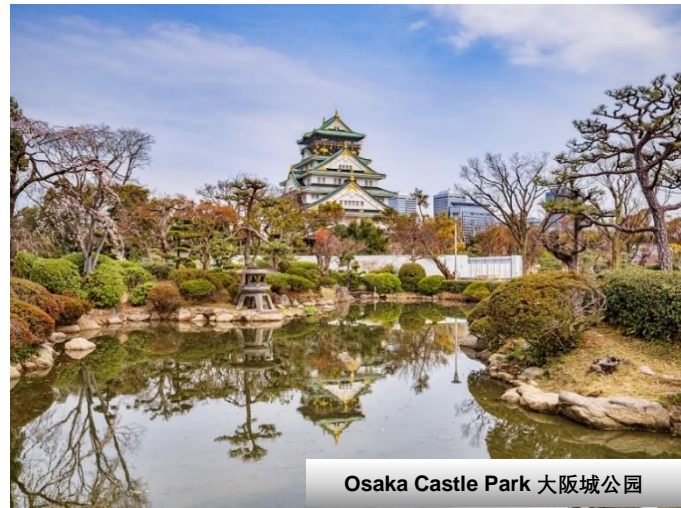
Osaka Castle Park 大阪城公园

After breakfast, proceed send to Osaka-Kansai International Airport 早餐后, 送往大阪-关西国际机场, 返回家园