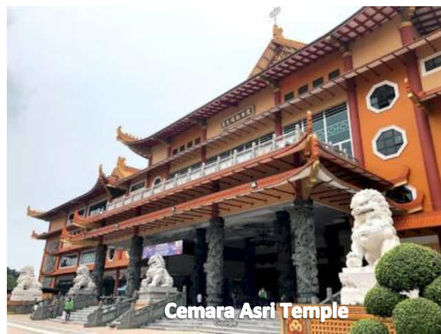
Cemara Asri Temple