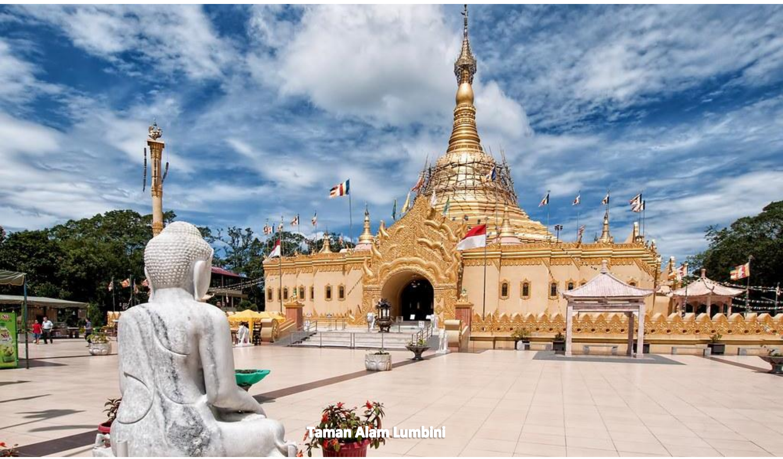
Taman Alam Lumbini

Taman Alam Lumbini was inspired from Shwedagon Pagoda in Myanmar. The project was successfully completed in 2010 with the scale for 46.8 meters in height, 68 meters in length, 68 meters in width. It is the second highest among the other pagoda outside from the Union Republic of Myanmar.