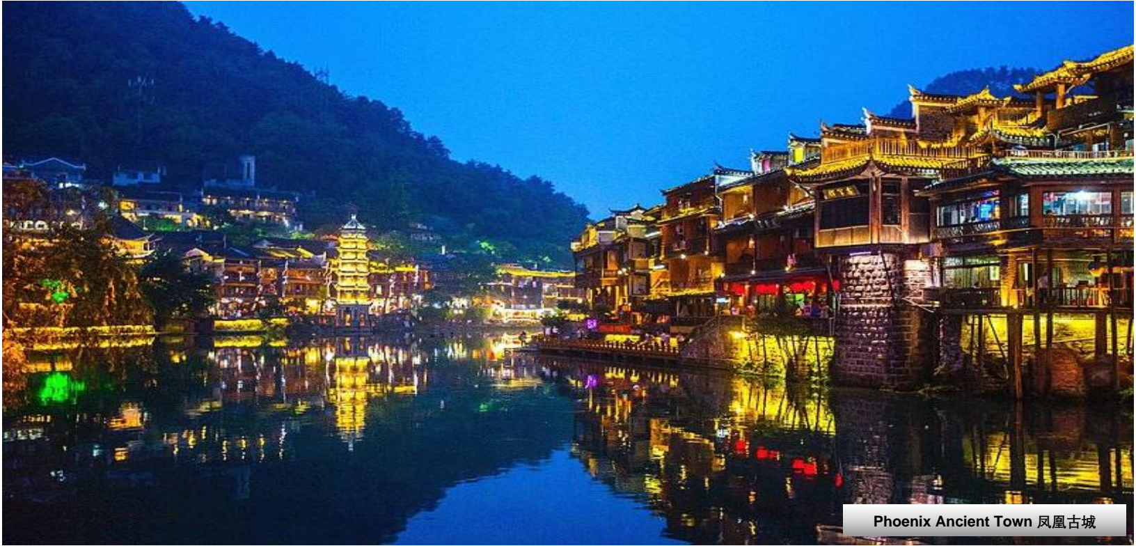
Phoenix Ancient Town 凤凰古城