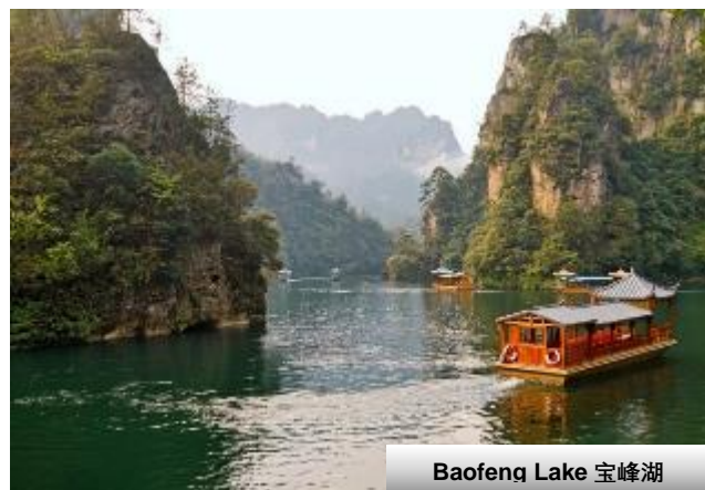
Baofeng Lake 宝峰湖