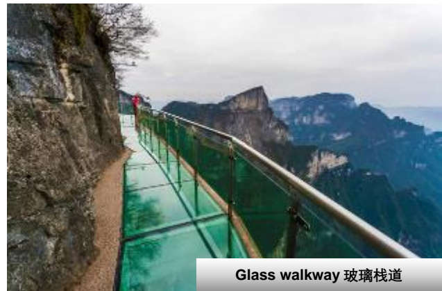
Glass walkway 玻璃栈道

*Sequence of itinerary subject to arrangement*