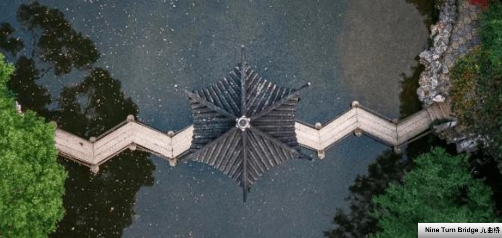
Nine Turn Bridge 九曲桥