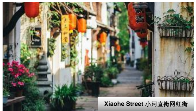
Xiaohu Street 小河直街网红街