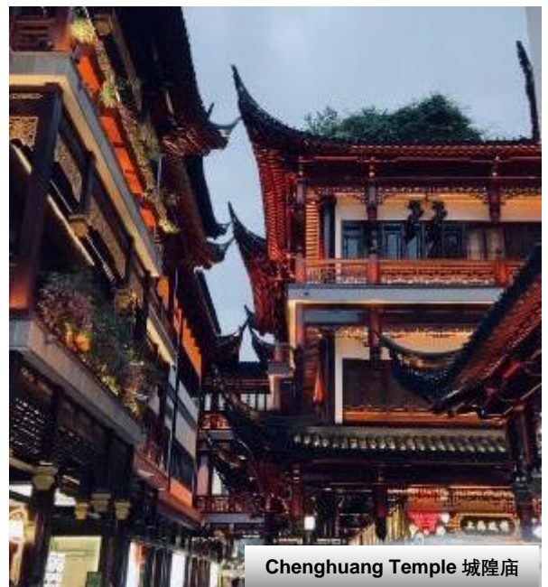
Chenghuang Temple 城隍庙