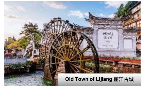
Old Town of Lijiang 丽江古城