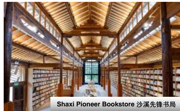
Shaxi Pioneer Bookstore 沙溪先锋书局