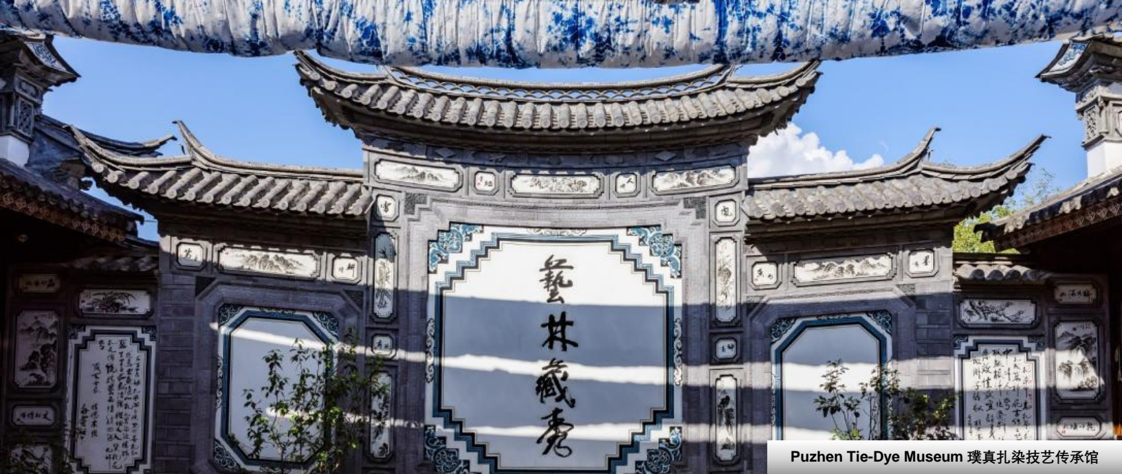
Puzhen Tie-Dye Museum 璞真扎染技艺传承馆