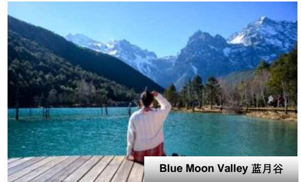
Blue Moon Valley 蓝月谷