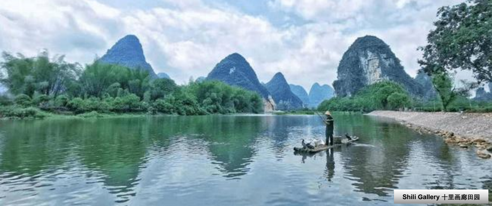
Shili Gallery 十里画廊田园