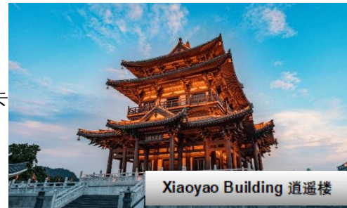
Xiaoyao Building 逍遥楼