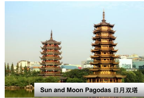
Sun and Moon Pagodas 日月双塔