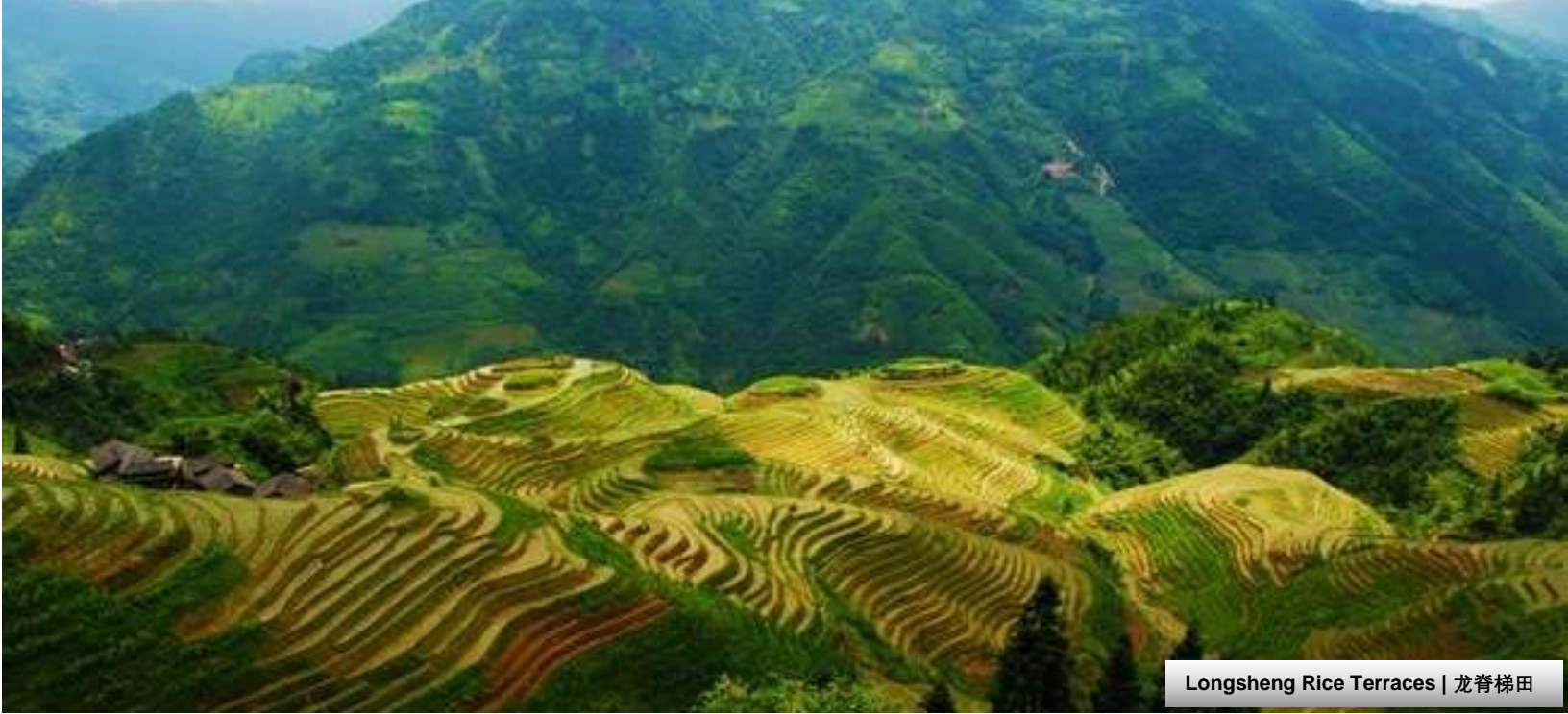
Longsheng Rice Terraces | 龙脊梯田