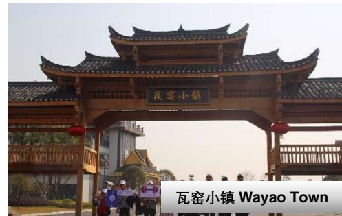
瓦窑小镇 Wayao Town