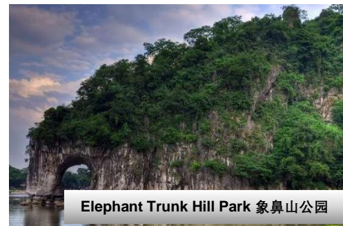
Elephant Trunk Hill Park 象鼻山公园