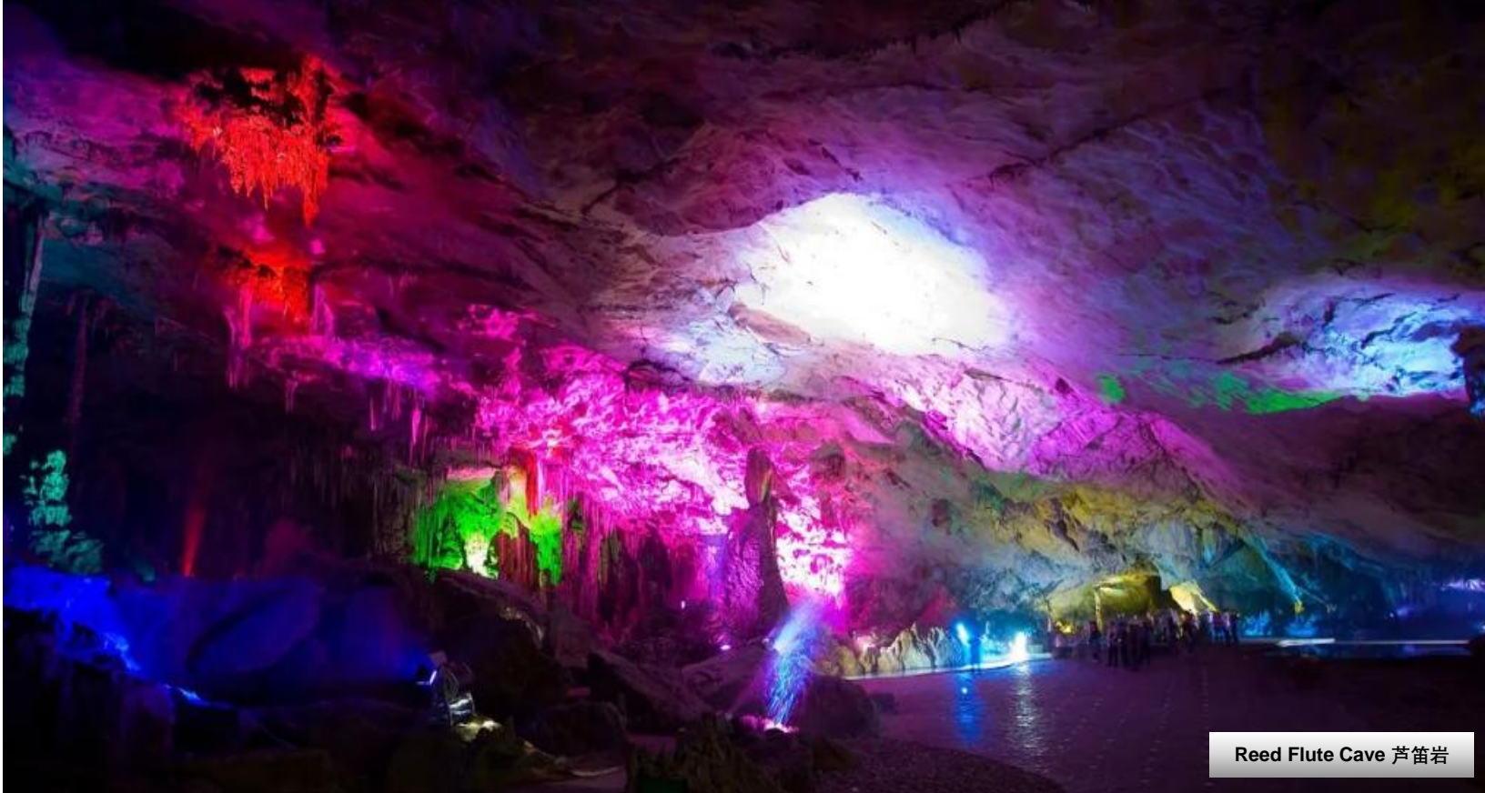
Reed Flute Cave 芦笛岩