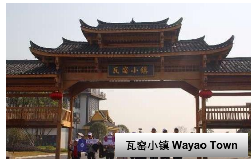
瓦窑小镇 Wayao Town