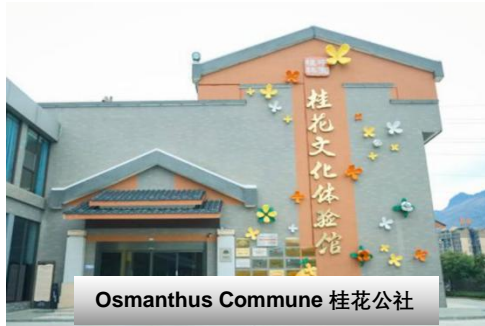
Osmanthus Commune 桂花公社