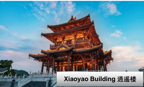
Xiaoyao Building 逍遥楼