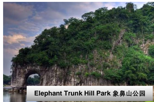
Elephant Trunk Hill Park 象鼻山公园