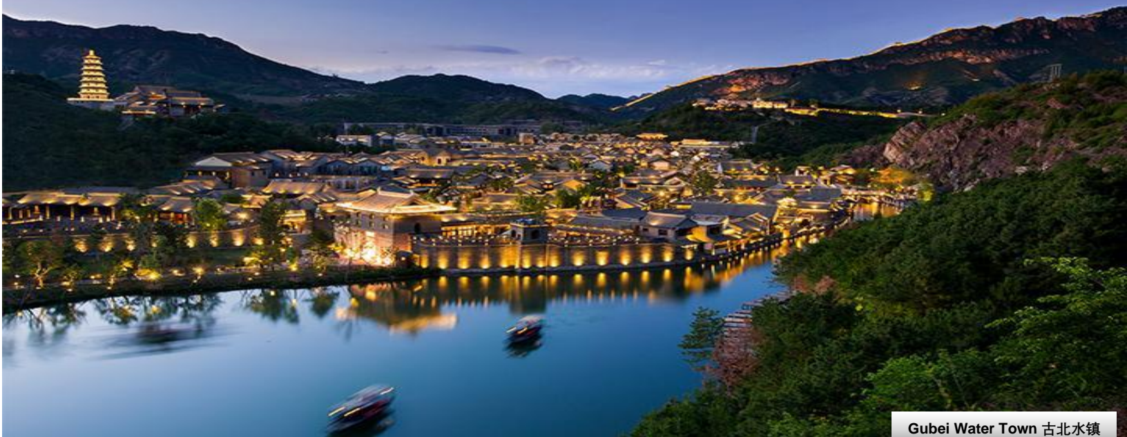
Gubei Water Town 古北水镇