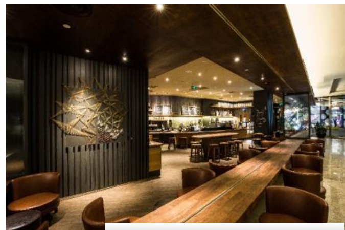
Starbucks Reserve Store 星巴克旗舰店