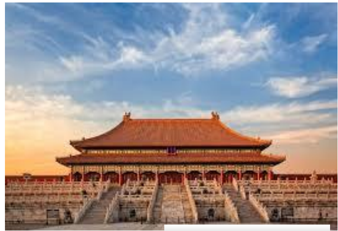
The Forbidden City 故宫