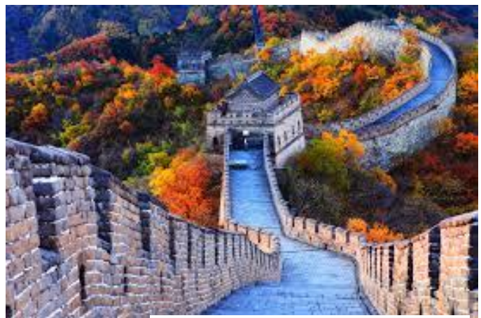
Mutianyu Great Wall Of China 慕田峪长城