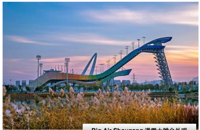
Big Air Shougang 滑雪大跳台外观