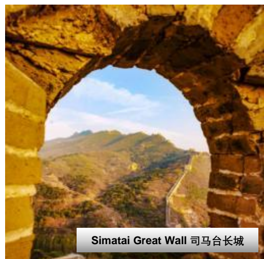
Simatai Great Wall 司马台长城

Taste of old Beijing, Beijing Roasted duck 老北京风味; 北京烤鸭