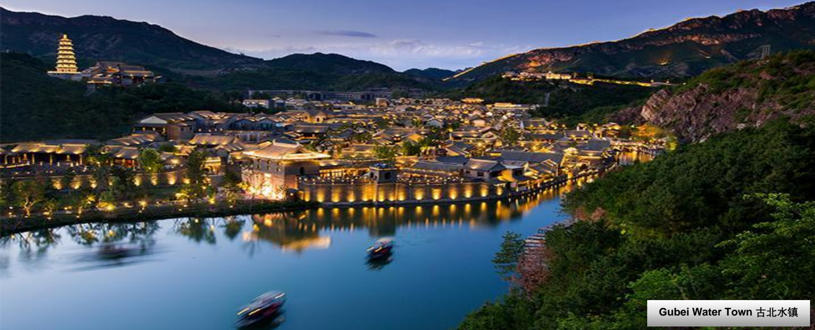
Gubei Water Town 古北水镇