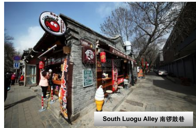
South Luogu Alley 南锣鼓巷