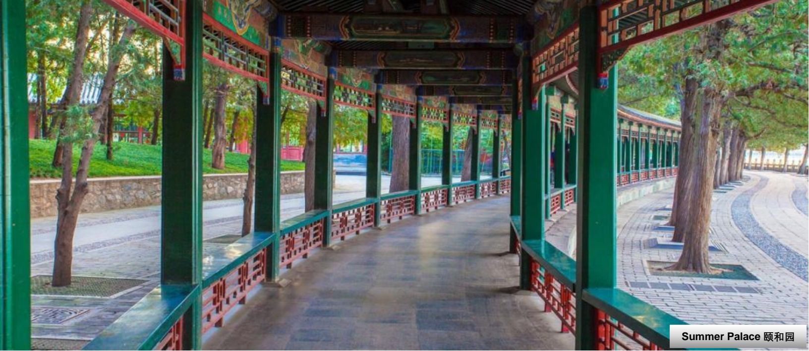
Summer Palace 颐和园