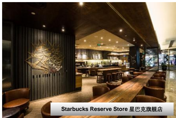
Starbucks Reserve Store 星巴克旗舰店