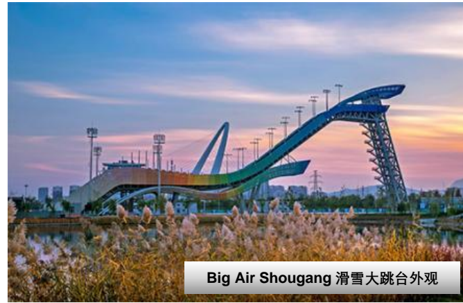
Big Air Shougang 滑雪大跳台外观