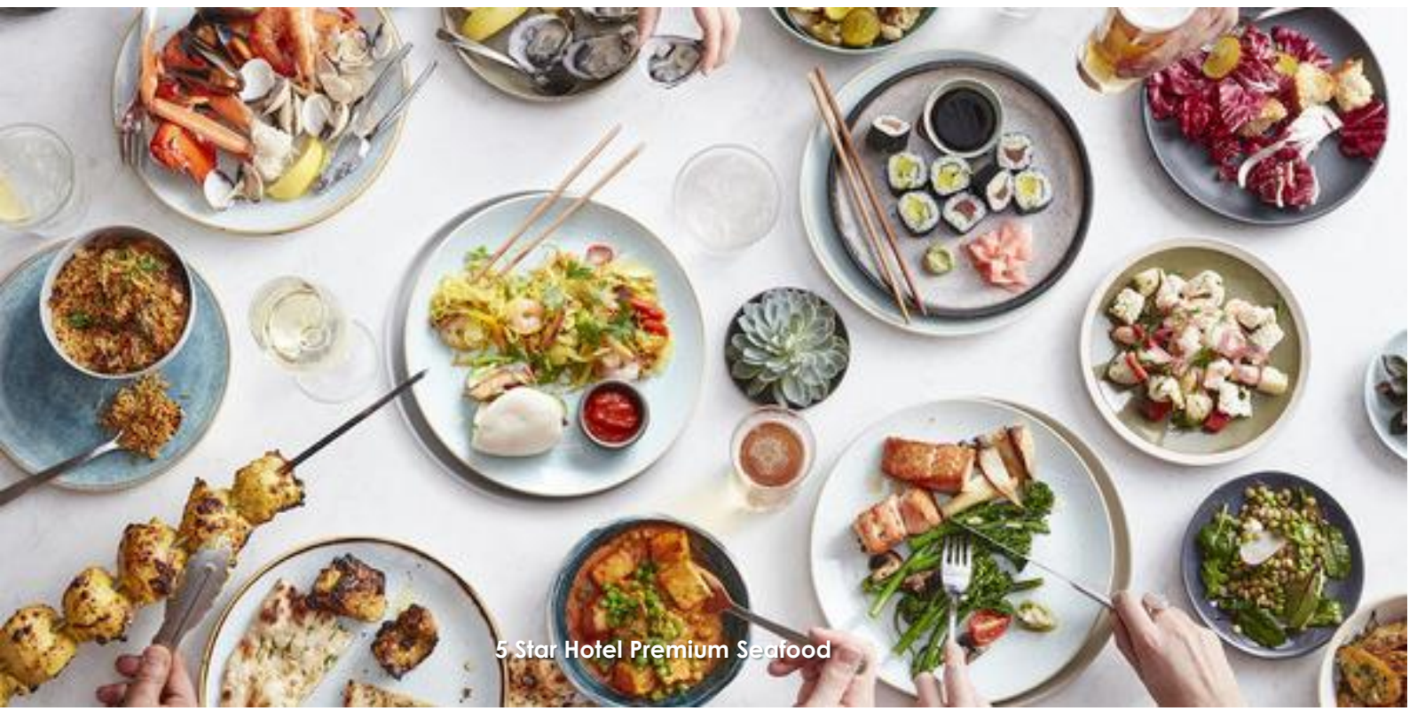
5 Star Hotel Premium Seafood

*Image shown are for illustration purposes only*