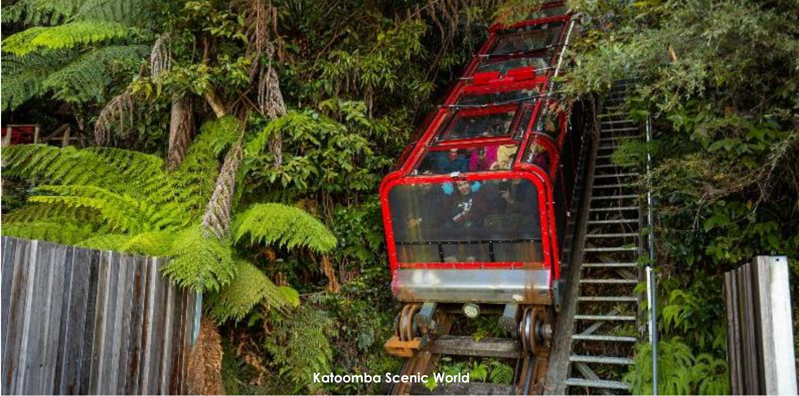
Katoomba Scenic World