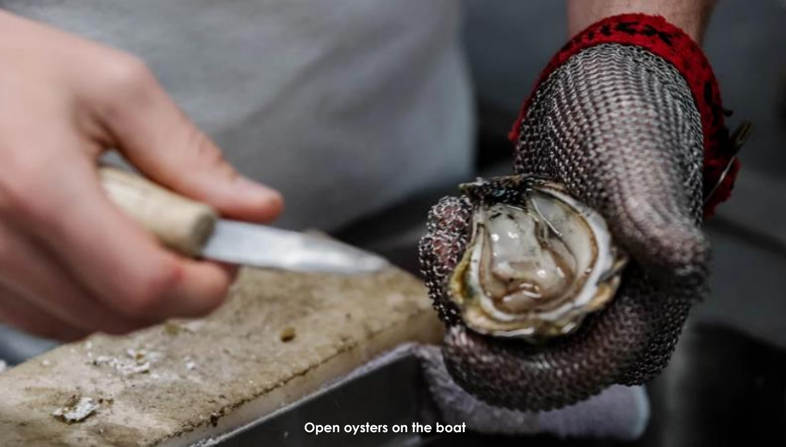
Open oysters on the boat