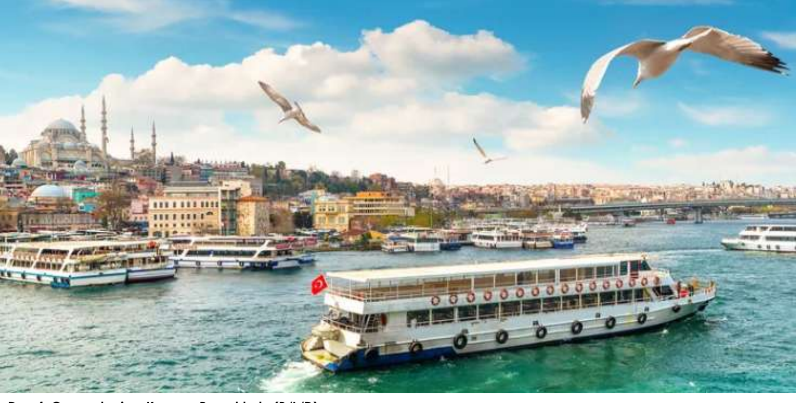
Day 4: Cappadocia – Konya - Pamukkale (B/L/D)