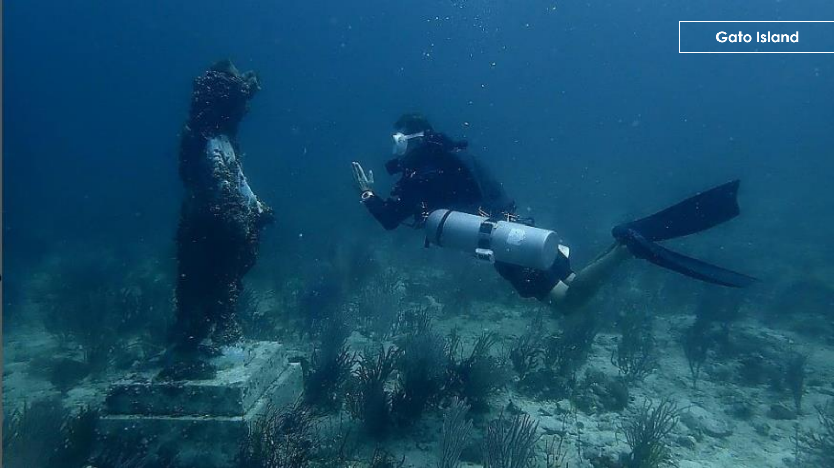
Day 3: Diving Day | Gato Island 猫岛

09.00hr, proceed to Gato Island for dive (White Tip Shark, Tunnel Dive). After that diving around that island (Local dive). Gado island not only a marine life sanctuary, but also a sanctuary for sea snakes. The dive site has a beginner-friendly underwater tunnel about 30 meters long and is full of soft corals, most notably white-sided dolphins, bamboo sharks and abundant soft corals, nudibranchs, seahorses and rays.