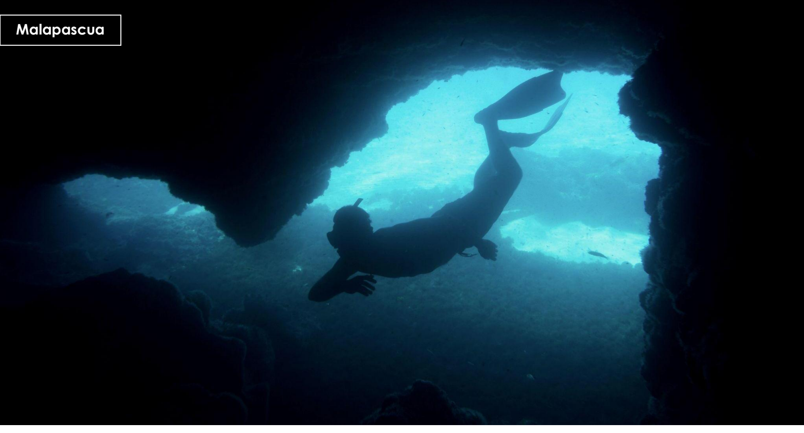
Day 1: Arrive Cebu Airport (CEB) 抵达宿务国际机场

On arrival Cebu Airport (Recommended arrival time in morning or before 11am), transfer from airport to New Maya Port (Approx. 3-4 hours). Take a private boat enter to Malapascua Island (Approx. 30 minutes). Check-in hotel.