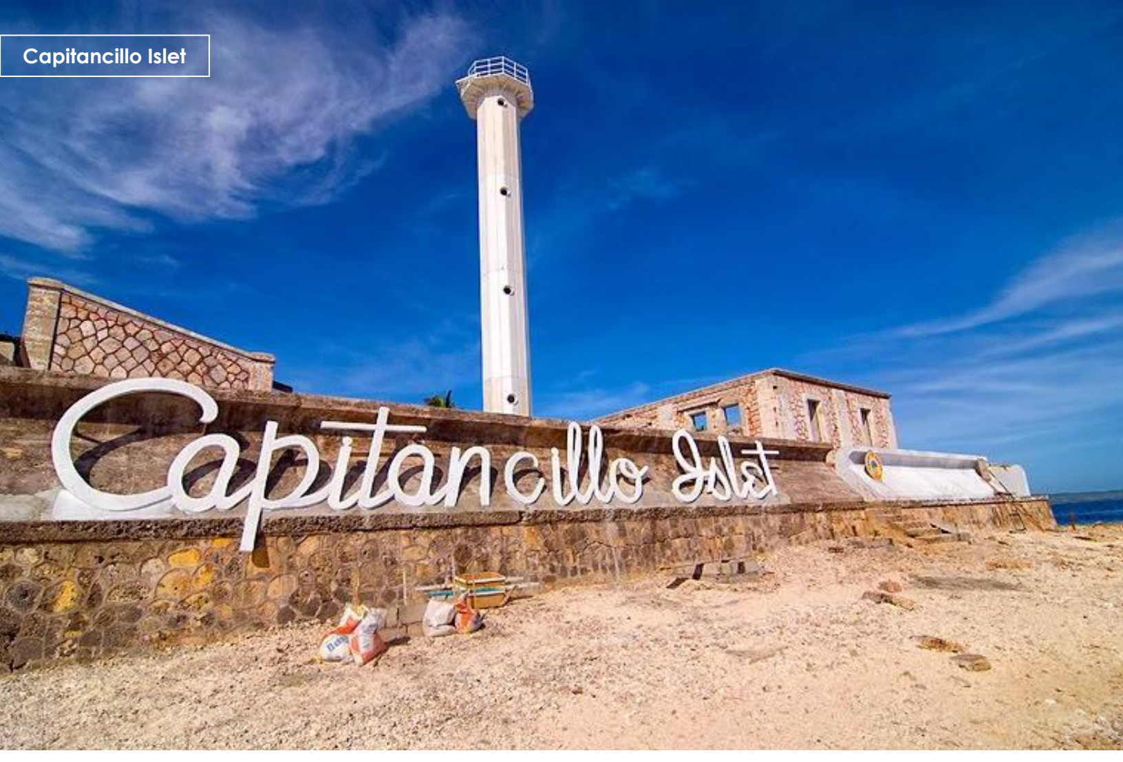
Day 5: Diving Day | Capitancillo 珊瑚島

08.00hr, proceed to Capitancillo for dive (Wall Dive). Capitancillo takes its name from the famous U.S. Navy Captain Cillo, who sailed his ships to this isolated and stunning island during World War II. Don't forget to take a beautiful picture of the island's military relics towering in the middle of the sea.