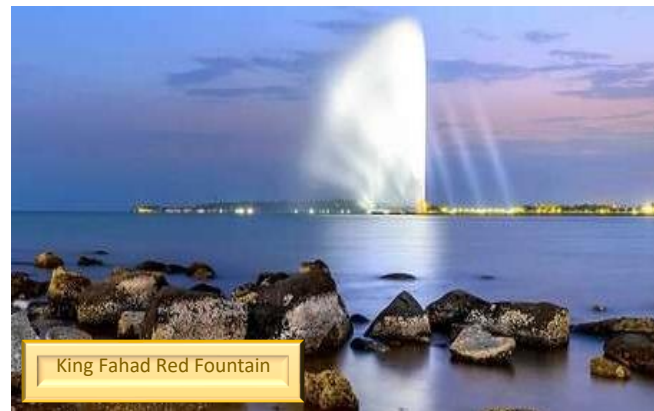
King Fahad Red Fountain

Accommodation: Shaden Hotel 4* or similar 沙登度假酒或相似酒店