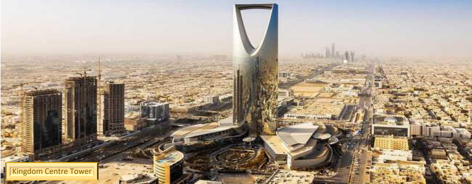
Kingdom Centre Tower