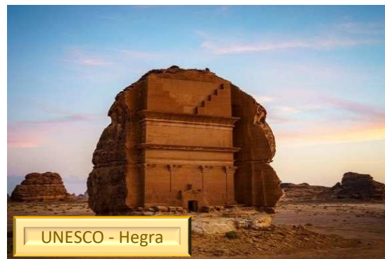
UNESCO - Hegra

Accommodation: Shaden Hotel 4* or similar 沙登度假酒或相似酒店