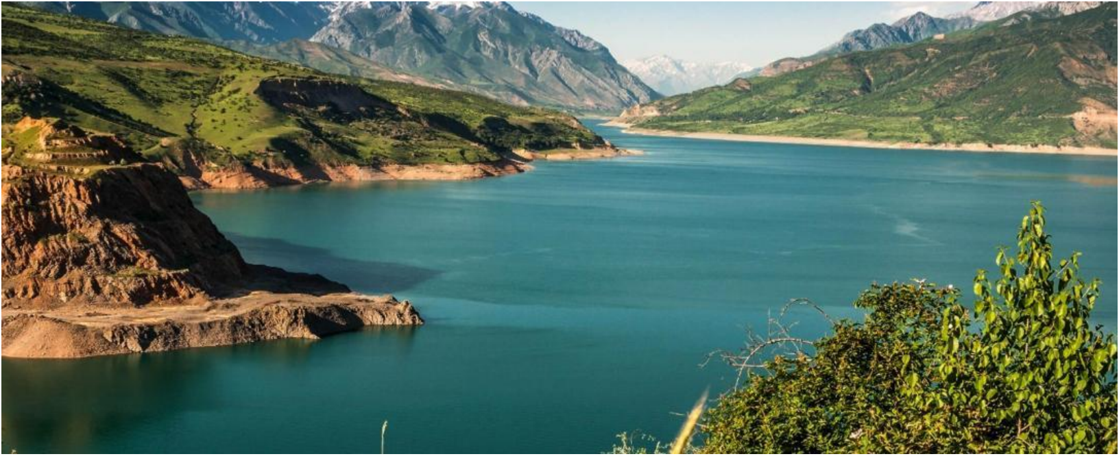
Day 7: Tashkent -Chimgan Mountain (TAS)- Kuala Lumpur 塔什干 - 大奇姆甘山脉-吉隆坡

After breakfast, you will move to Chimgan mountain. As quick as a visit, ride a lift chair (20minute) to reach the top to see the Beldersay peak (30 min one-way). You will have free time to walk and enjoy nature. While returning, you will stop at the shore of Charvak Lake for your leisure and water activities (optional). At the end of the day, transfer to airport and home flights.