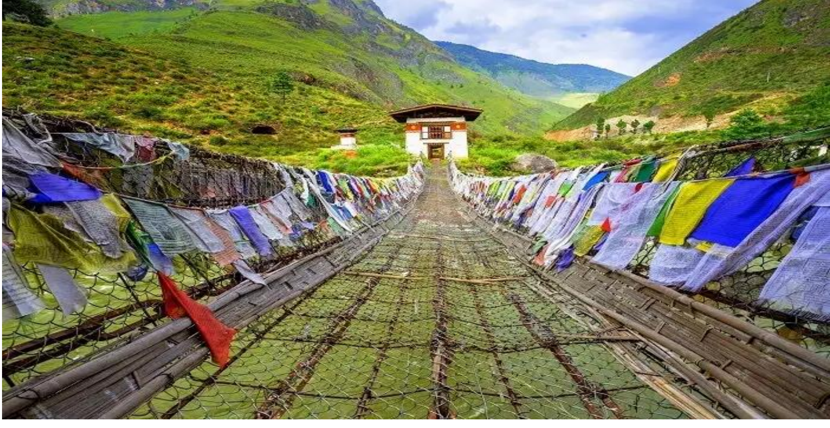
Day 5: Punakha → Paro (120Kms / 4½ Hrs Drive Approx) 普那卡 → 帕罗 (120 公里 / 4½小时车程) (B/L/D)