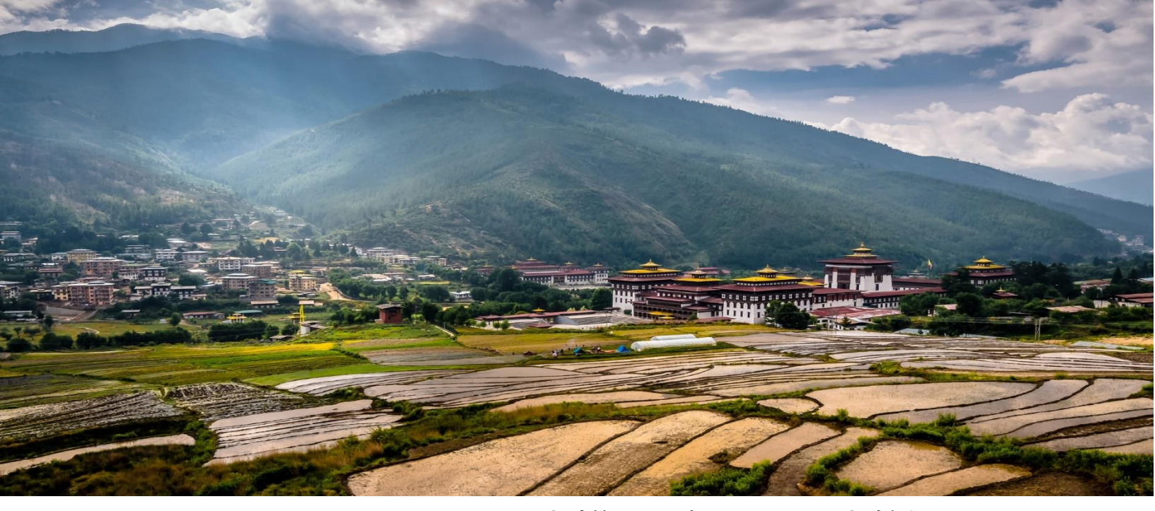
Day 1: Arrive Paro → Thimphu (55Kms / 1½ Hrs Drive) 抵达帕罗 → 廷布 (55 公里 / 1.5 小时车程) (L/D)