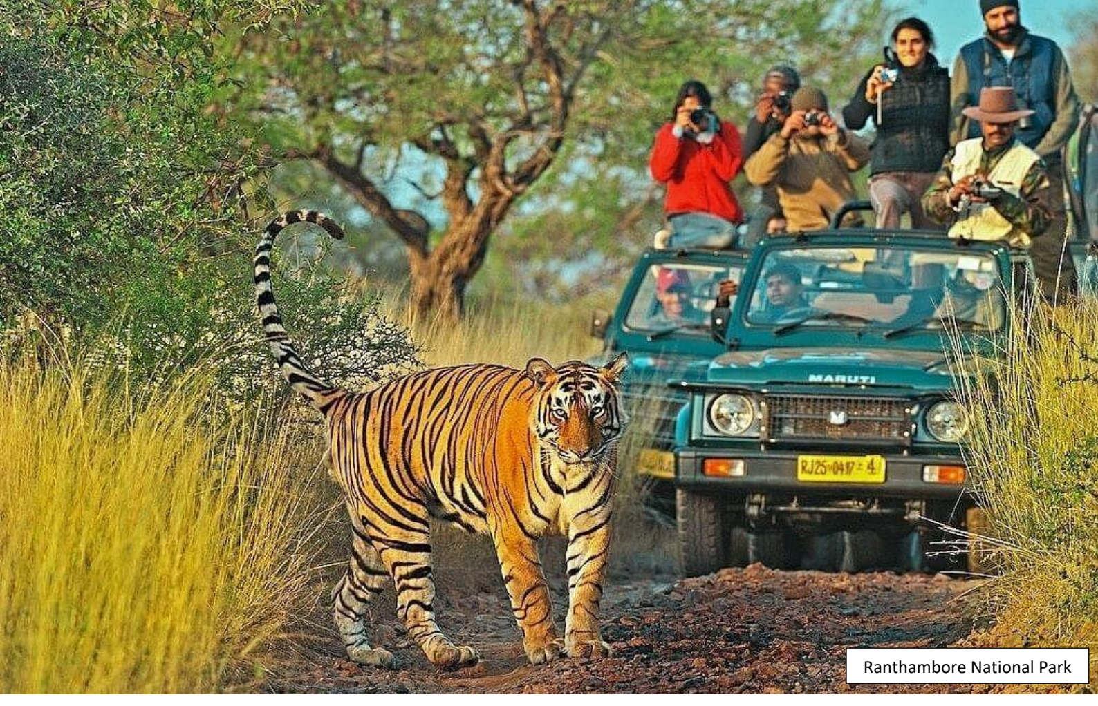
Day 4 : Jaipur - Ranthambore (156 km / 4 hrs approx) 斋浦尔 - 兰滕博尔(约 156 公里/4 小时)(B/L/D)

After breakfast, drive to Ranthambore. Upon arrival, check in to your hotel. Evening Jungle safari in the park (Jeep Safari's Closed on Wednesday) Ranthambore National Park is known to have India's Friendliest tigers Assured of protection , these nocturnal