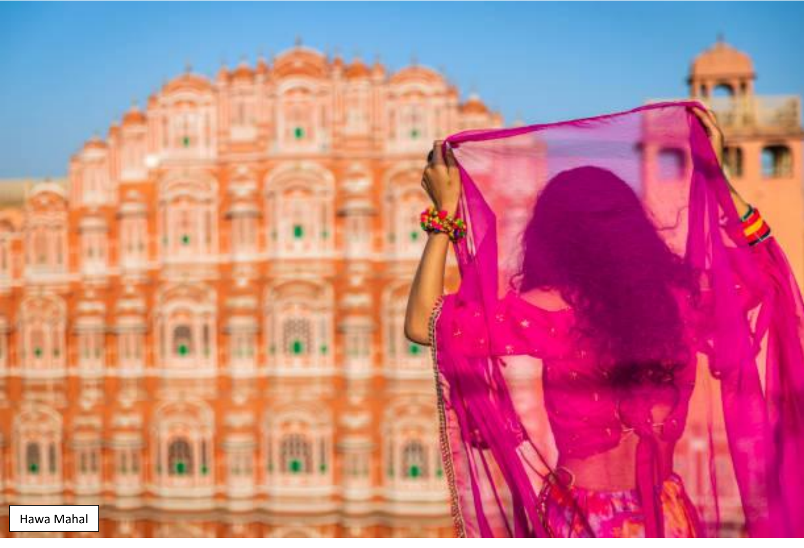
Day 1: Arrive Delhi 抵达德里 {DEL}

Upon arrival, you will be greeted and transferred to hotel. 抵达后,我们将接送您并送往酒店入住。